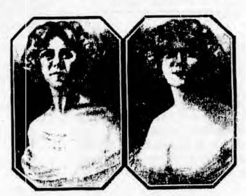
These pictures show the wonderful bust development referred to in this article.

SHE DEVELOPED HER BUST SIX INCHES IN THIRTY DAYS.