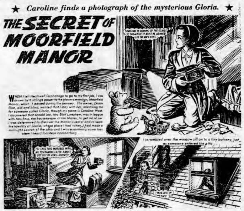
Illustrations from BUNTY in the early 1960s.

On 18.5.96 the Daily Telegraph featured the longest-running girls' comic, D.C. Thomson's BUNTY, which is still running since its first number in January 1958. The article emphasises that BUNTY has a simple ethos: try hard, don't follow the crowd, be loyal to your friends and play the game; dishonesty does not pay, nor does bullying.